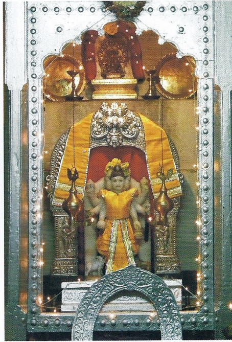
SHREE SATCHIDANANDA DATTATREYA DEV, KUNDAPURA