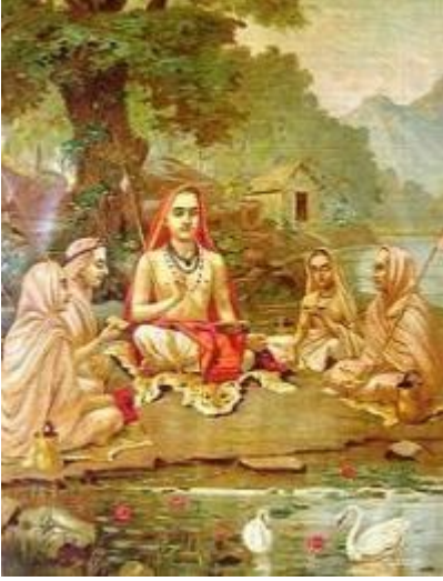
Adi Shankaracharya Painting by : Raja Ravi Varma

Bharati now interposed and said to Sankara: "I am the other half of Mandana. You have defeated only one half of Mandana. Let us have a controversy". Sankara objected to have controversy with a woman. Bharati quoted instances wherein there had been controversies with Women. Sankara then agreed and this controversy also went on uninterruptedly for seventeen days. Bharati passed from one Shastra to another. At last she found out that she could not defeat Sankara. She decided to defeat him by means of the science of Kama Shastra.